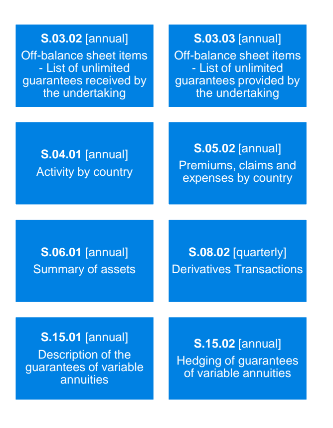
Figure 3: Templates Removed

Figure 3 shows the templates that have been removed.