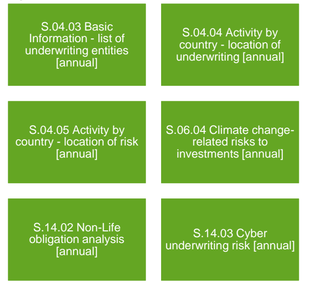
Figure 4: New Templates

The templates shown in Figure 4 have been added.